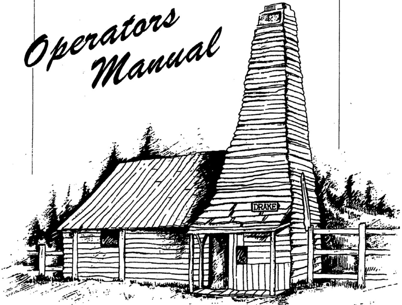
Oil & Gas The Drake Well 1859 Titusville, Pennsylvania